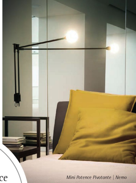
Mini Potence Pivotante | Nemo

With advancing technology, workspace productivity can be enhanced through creativity, flexibility, and innovative ideas.