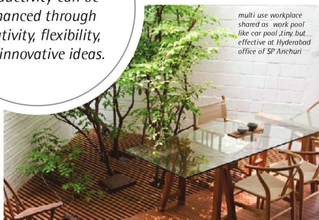
multi use workplace shared as work pool like car pool, tiny but effective at Hyderabad office of SP Anchuri